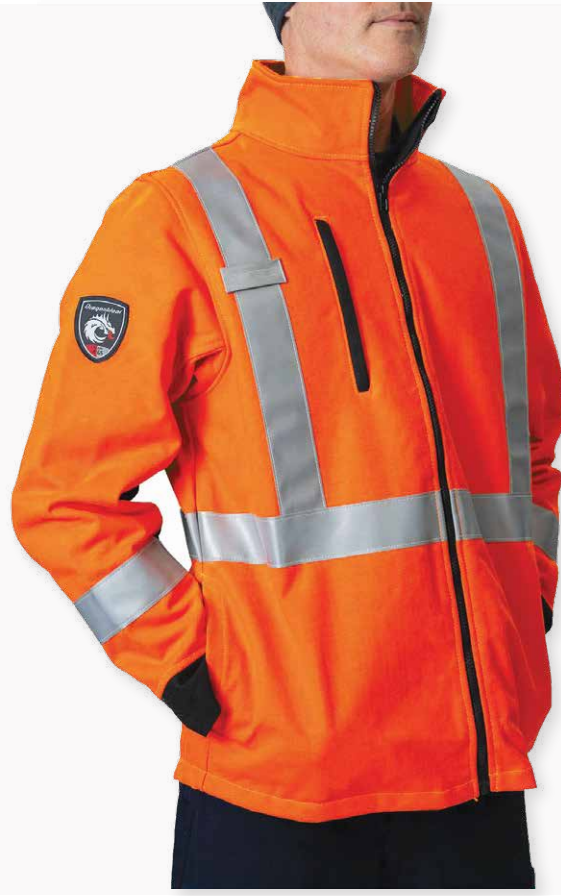
THE SHIELD™ (HI-VIS)