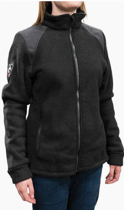
EXXTREME™ JACKET (WOMEN'S)