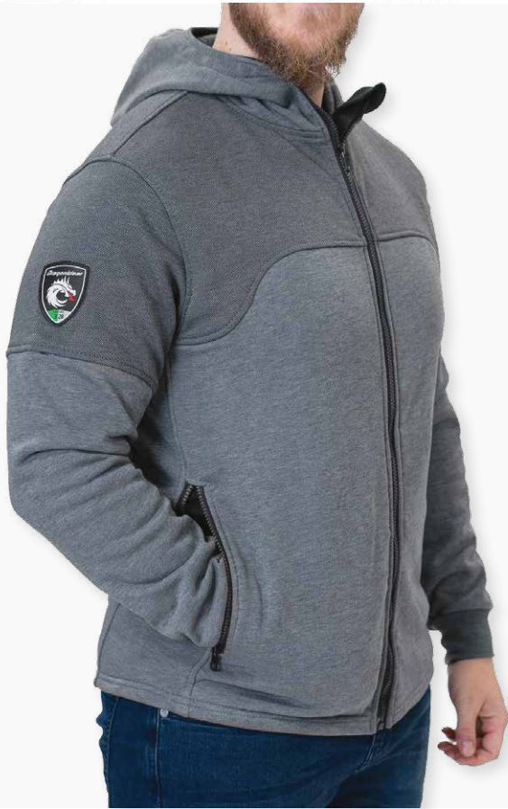
ELEMENTS™ FLAK JACKET