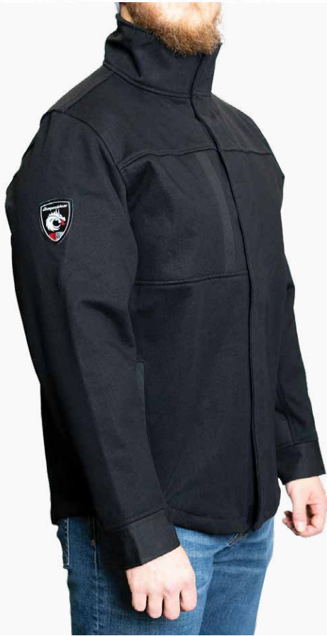
THE SHIELD™ (BLACK)