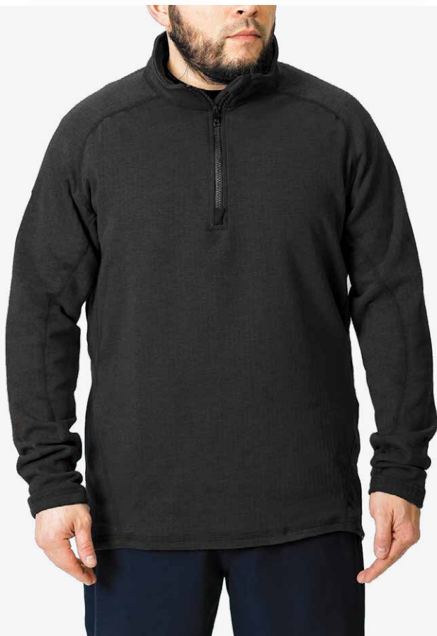
LIVEWIRE™ 1/4 ZIP SHIRT