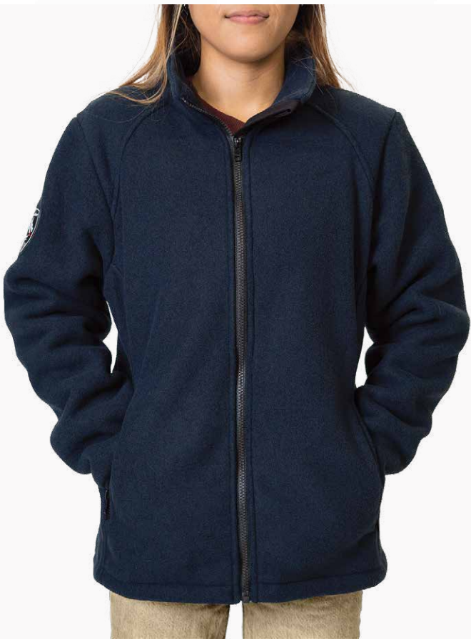
ALPHA™ JACKET (WOMEN'S)