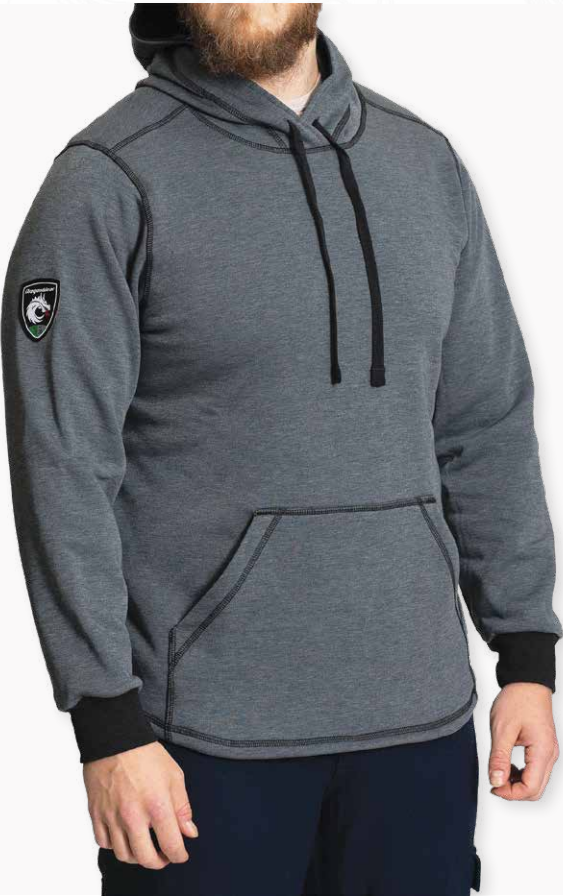
ELEMENTS™ CYCLONE HOODIE