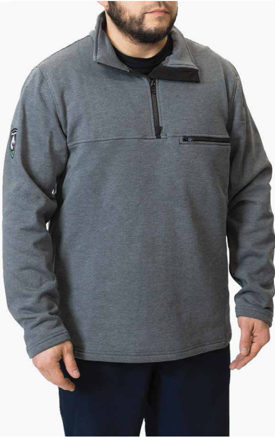
ELEMENTS™ FR SWEATSHIRT