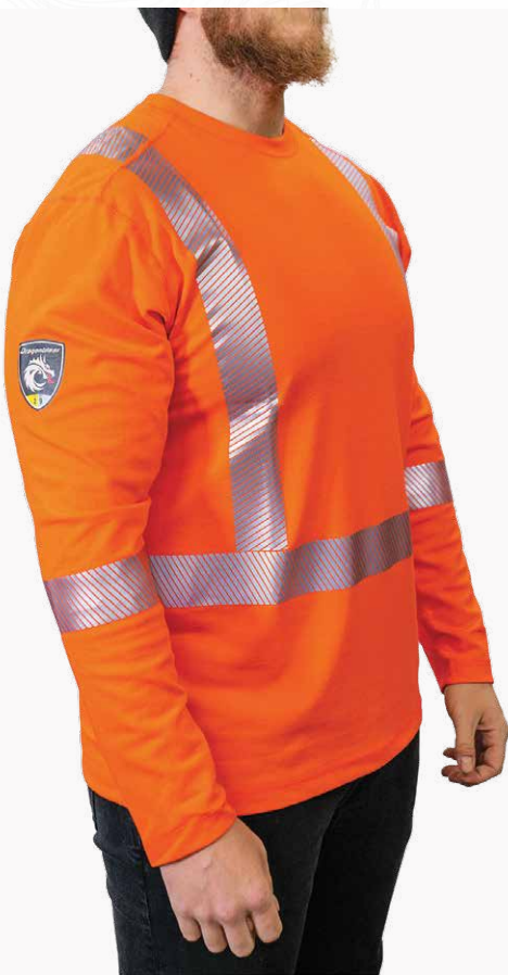
PRO DRY® HI VIS SHIRT (ORANGE)