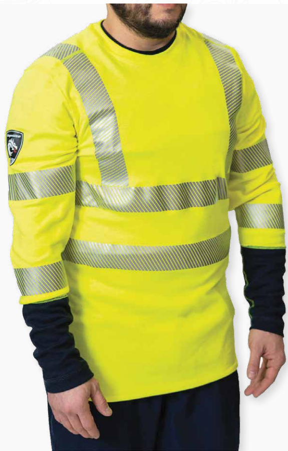
PRO DRY® HI VIS SHIRT (YELLOW)