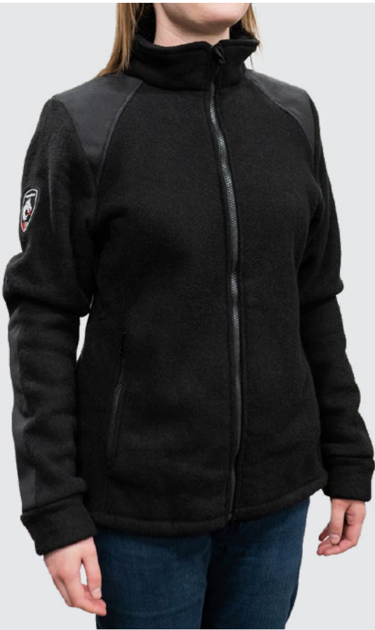
EXXTREME™ JACKET (WOMEN'S)