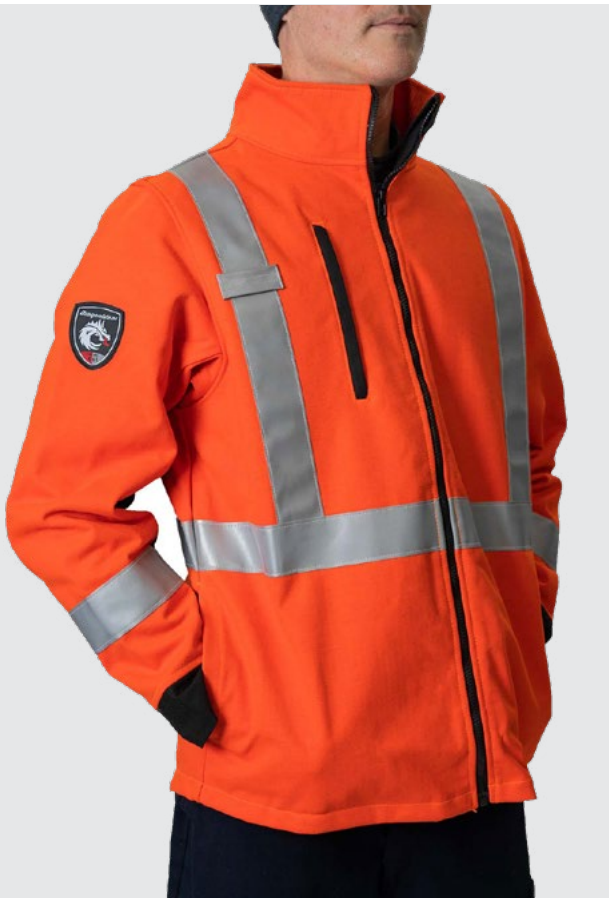
THE SHIELD™ (HI-VIS)