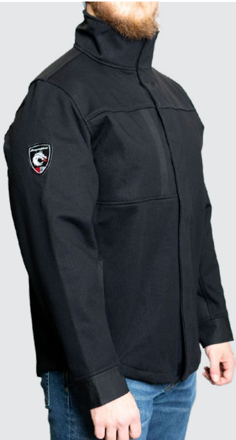
THE SHIELD™ (BLACK)